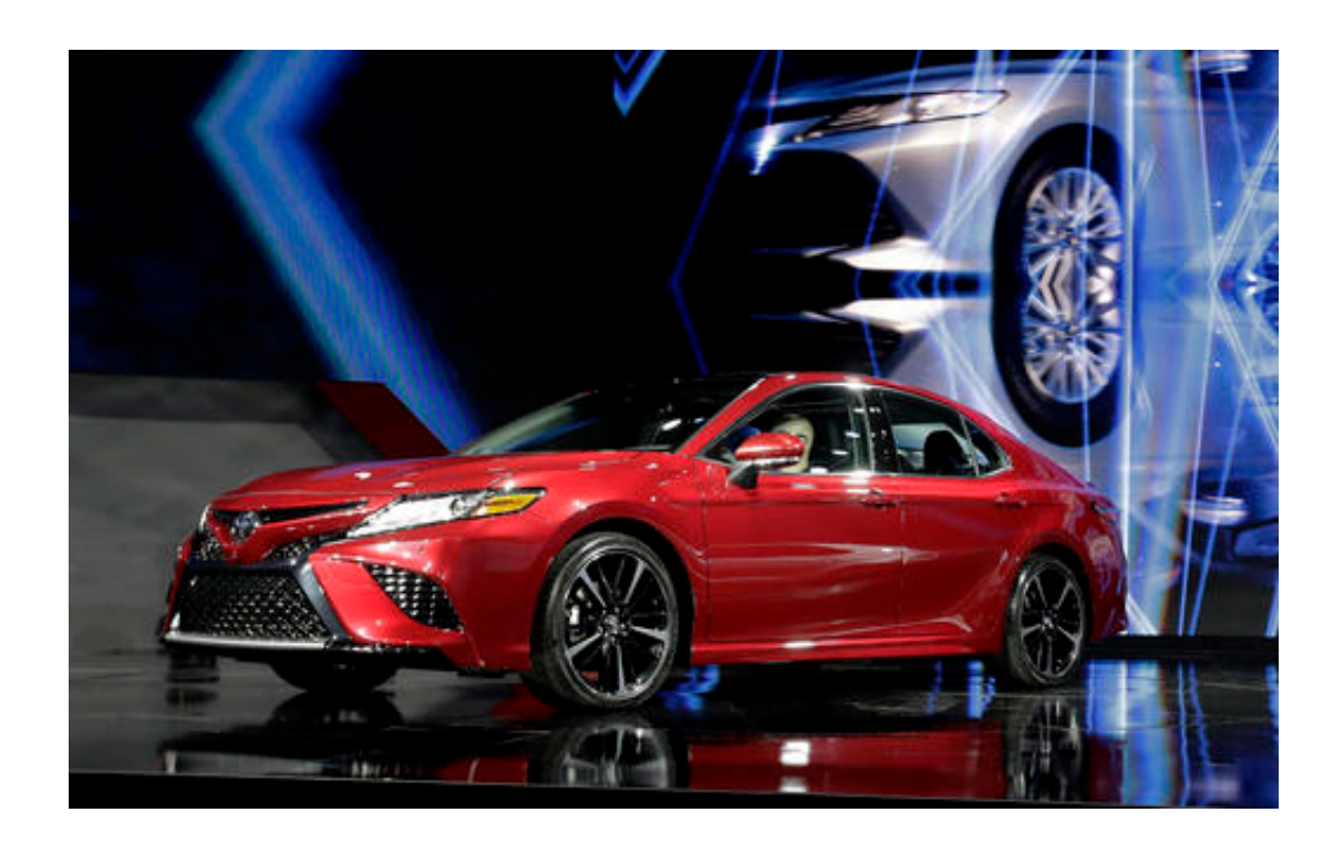
The 2018 Toyota Camry is presented at the North American International Auto show, Monday, Jan. 9, 2017, in Detroit. Toyota unveiled the eighth-generation Camry at the auto show Monday.

The new Honda Odyssey minivan is unveiled at the North American International Auto Show, Monday, Jan. 9, 2017, in Detroit.