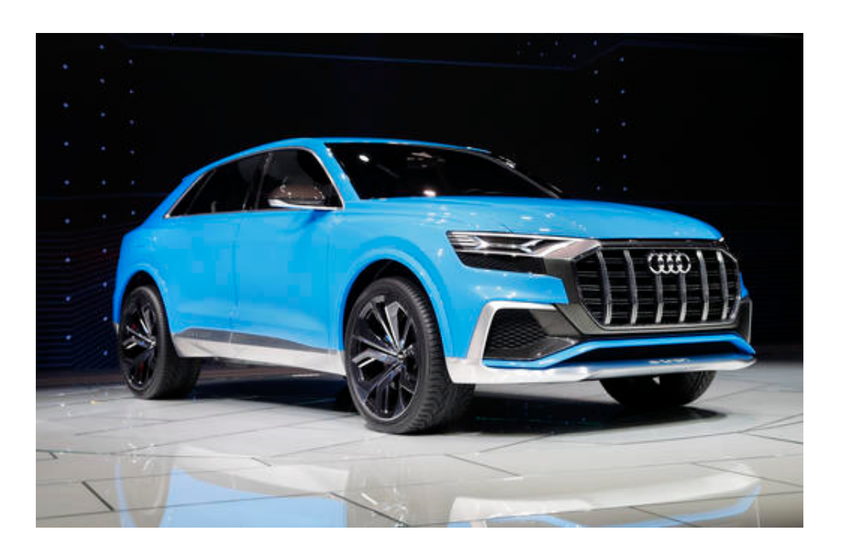
The Audi Q8 concept debuts at the North American International Auto Show in Detroit, Monday, Jan. 9, 2017.