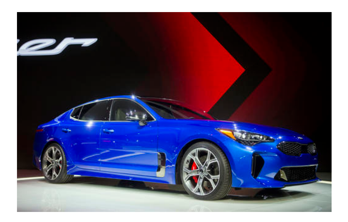
The Kia Stinger sports sedan is unveiled at the North American International Auto Show, Monday, Jan. 9, 2017, in Detroit.