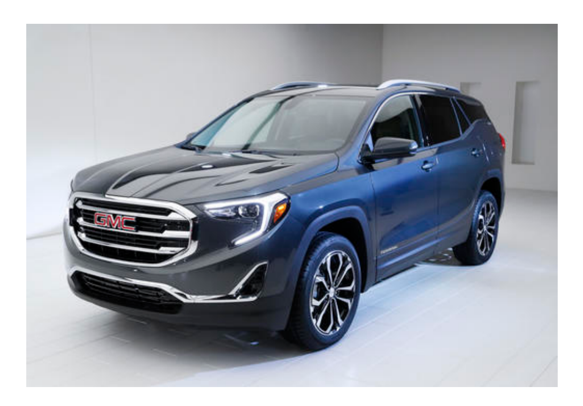
The 2018 GMC Terrain debuts at the North American International Auto Show in Detroit, Sunday, Jan. 8, 2017.