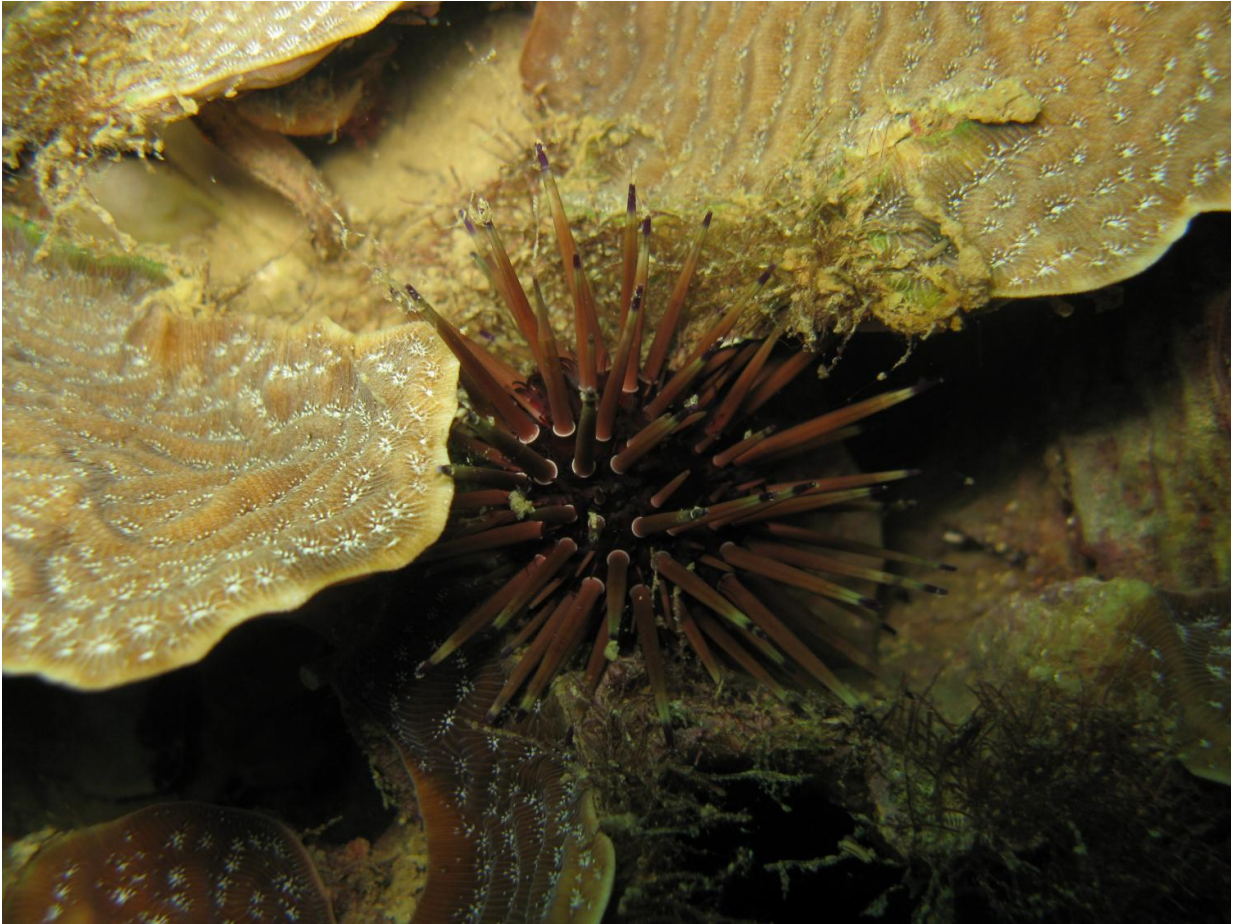
Echinometra viridis .

In Jan., 1983, STRI staff scientist Harilaos Lessios noticed that long-spined black urchins, but not other species of urchins were dying near the Atlantic entrance of the Panama Canal. He contacted dive shops and was able to track the mass mortality of urchins as it spread across the Caribbean from 1983-1984.