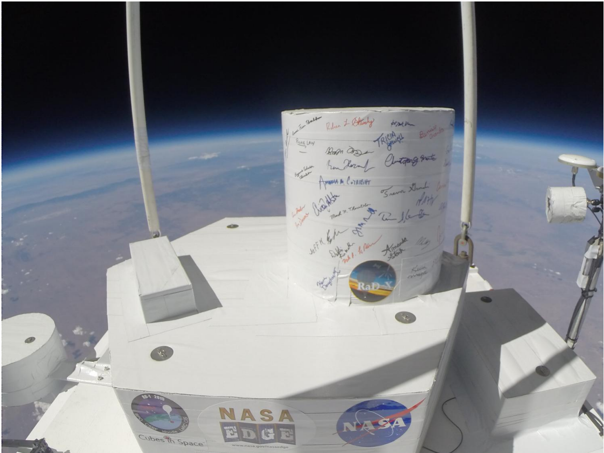
The RaD-X payload ascended into the stratosphere to measure cosmic radiation coming from the sun and interstellar space.

Earth's magnetosphere, which acts as a giant magnetic shield, blocks most of the radiation from ever reaching the planet. Particles with sufficient energy, however, can penetrate both Earth's magnetosphere and atmosphere, where they collide with molecules of nitrogen and oxygen. These collisions cause the high-energy particles to decay into different particles through processes known as nucleonic and