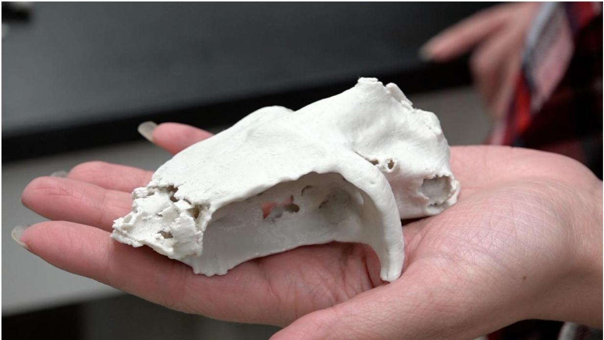
3-D printout of the Dwykaselachus brain case.

At the surface, Dwykaselachus appeared to be a symmoriid shark, a bizarre group of 300+ million-year-old sharks, known for their unusual dorsal fin spines, some resembling boom-like prongs and others surreal ironing boards.