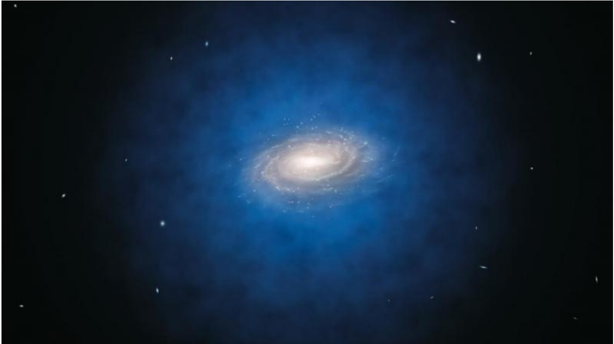
Artistic impression of the Milky Way galaxy with the mysterious dark matter halo shown in blue, but actually invisible.

The magnets used for these types of experiments have the shape of a coil wound into a helix, technically known as a solenoid. However, depending on the height of the magnet, there is the risk of losing the signal coming from the axion-photon interaction. For this reason, IBS scientists decided to look deeper into another type of magnets shaped like donuts, called toroidal magnets.