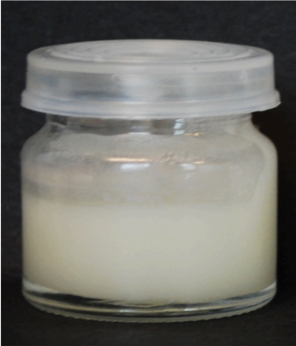
Macroscopic view of gel.

The researchers combined several spectroscopic techniques to explore the gels on multiple scales. They managed to define the molecular interactions of the hybrid organic-inorganic gel system and the mechanisms of gelling. The team uncovered processes similar to those behind the drying and aging of oils. Lead is known to accelerate these processes, which explains the formation of the gel. These findings show