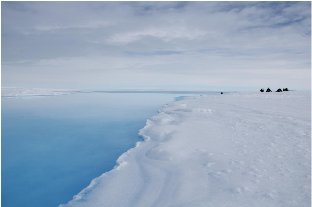
Meltwater stream inside the crater on the Roi Baudouin ice shelf.

Combining climate models, satellite data and on-site measurements, they concluded that strong winds carrying warm air were blowing away reflective snow, allowing the Sun's rays to be absorbed into the darker ice rather than bounced back into space.