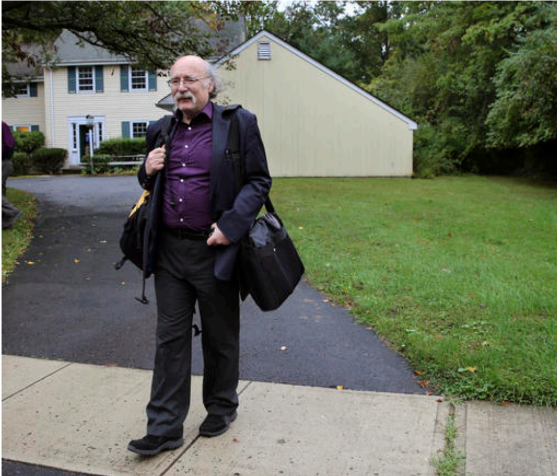
Princeton University physics professor F. Duncan Haldane leaves his home after it was announced that he has been awarded the 2016 Nobel Prize in Physics early Tuesday, Oct. 4, 2016, in Princeton, N.J. Haldane shares the award with fellow scientists David Thouless and Michael Kosterlitz.