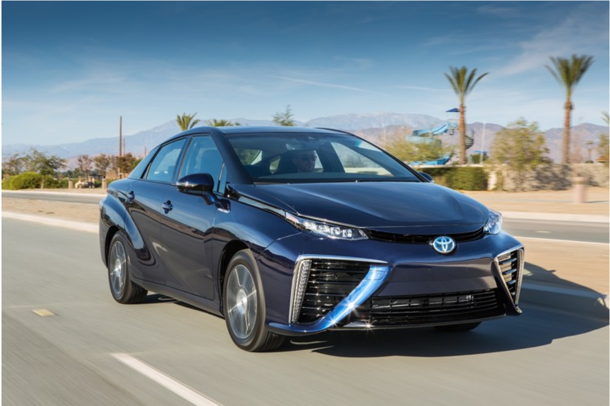
Toyota's hydrogen fuel cell car 'Mirai'.