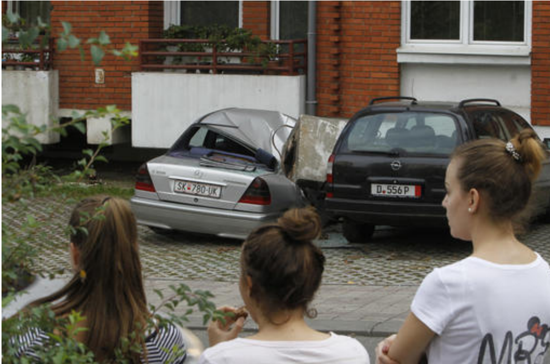
Girls look at a car, demolished by a concrete block after an earthquake in Skopje, Macedonia, Sunday, Sept. 11, 2016. Macedonian authorities say an earthquake with a preliminary magnitude of 5.3 struck on the outskirts of the capital, Skopje, Sunday causing minor damage to buildings but no injury.