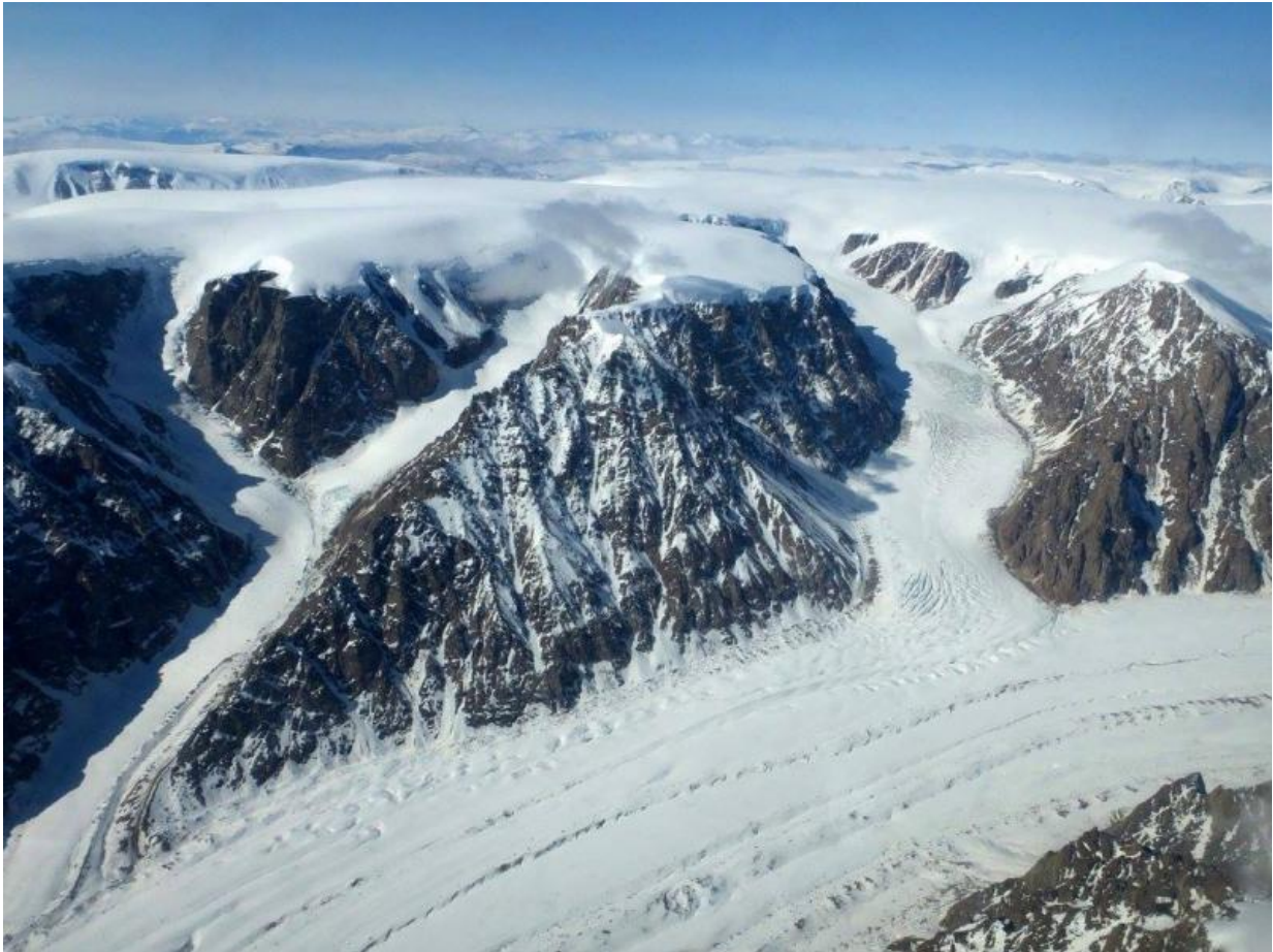
The Greenland Ice sheet discharging into valleys.