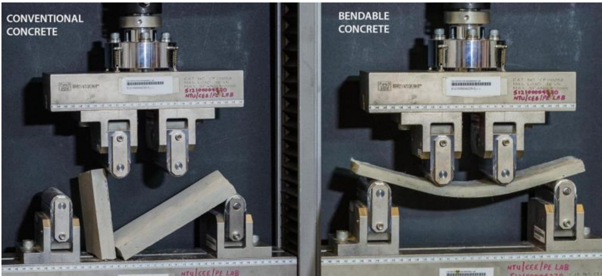
Conventional Concrete vs Bendable Concrete developed at NTU.