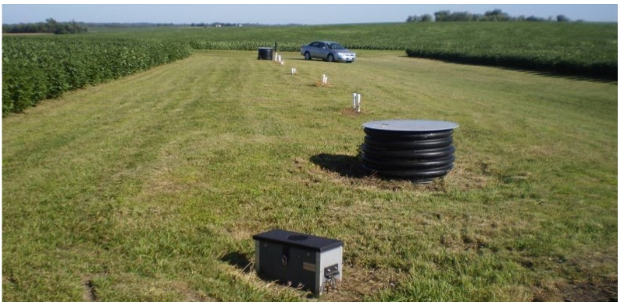
Monitoring wells above an installed bioreactor on a research farm in Iowa.

Bioreactors have a simple construction. Although sizes vary, a typical trench is 100 feet long and 20 feet wide, and covered by one foot of top soil. The trench is generally 3.5 feet deep and filled with carbon-rich food sources for bacteria, like woodchips or corn. Tile pipes from the fields are re-routed through the trench before flowing into the stream.