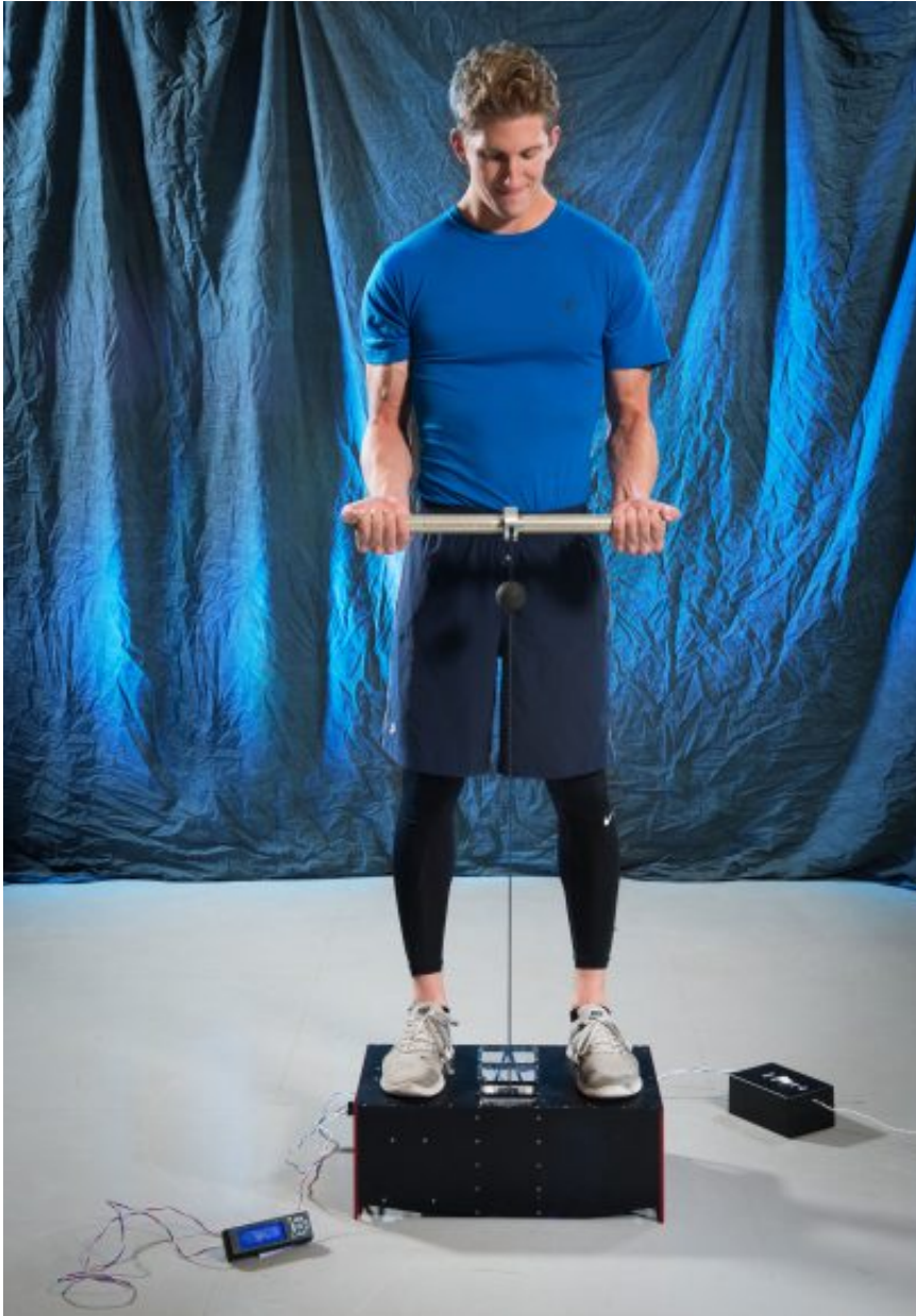
The ROCKY device in action.