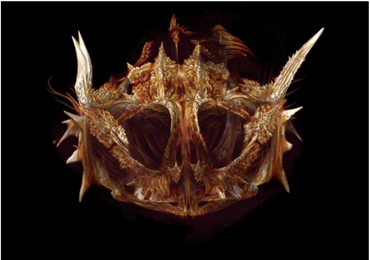
Enophrys taurina (Bull sculpin).