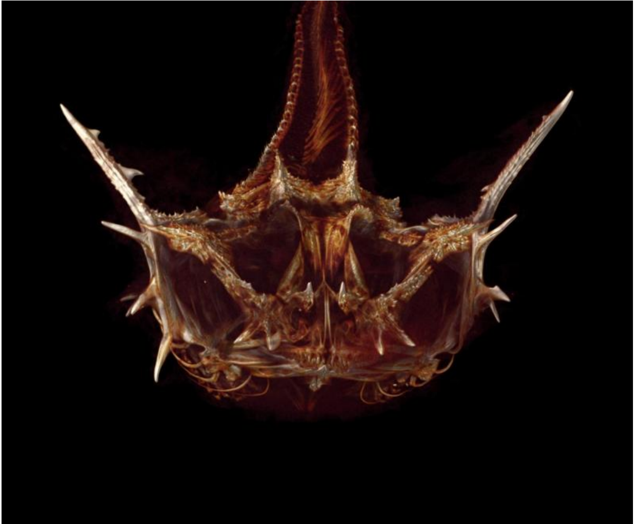
Enophrys diceraus (Antlered sculpin)