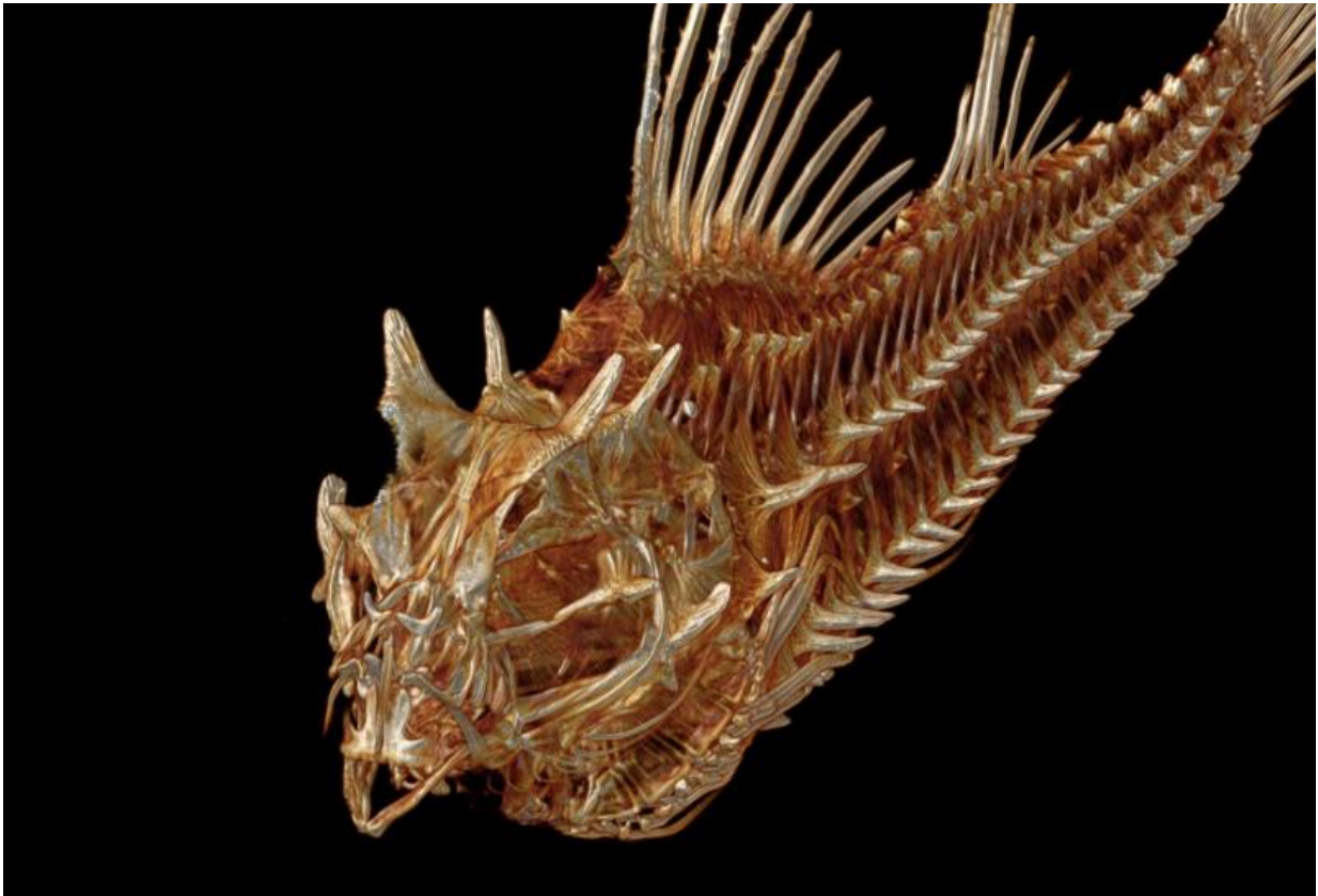
Hypsagonus quadricornis (Fourhorn poacher).

Additionally, he doesn't scan at the highest-possible resolution, because few scientists actually need that much detailed data. This saves more time and digital space—and makes it possible for people to access the files more easily online.