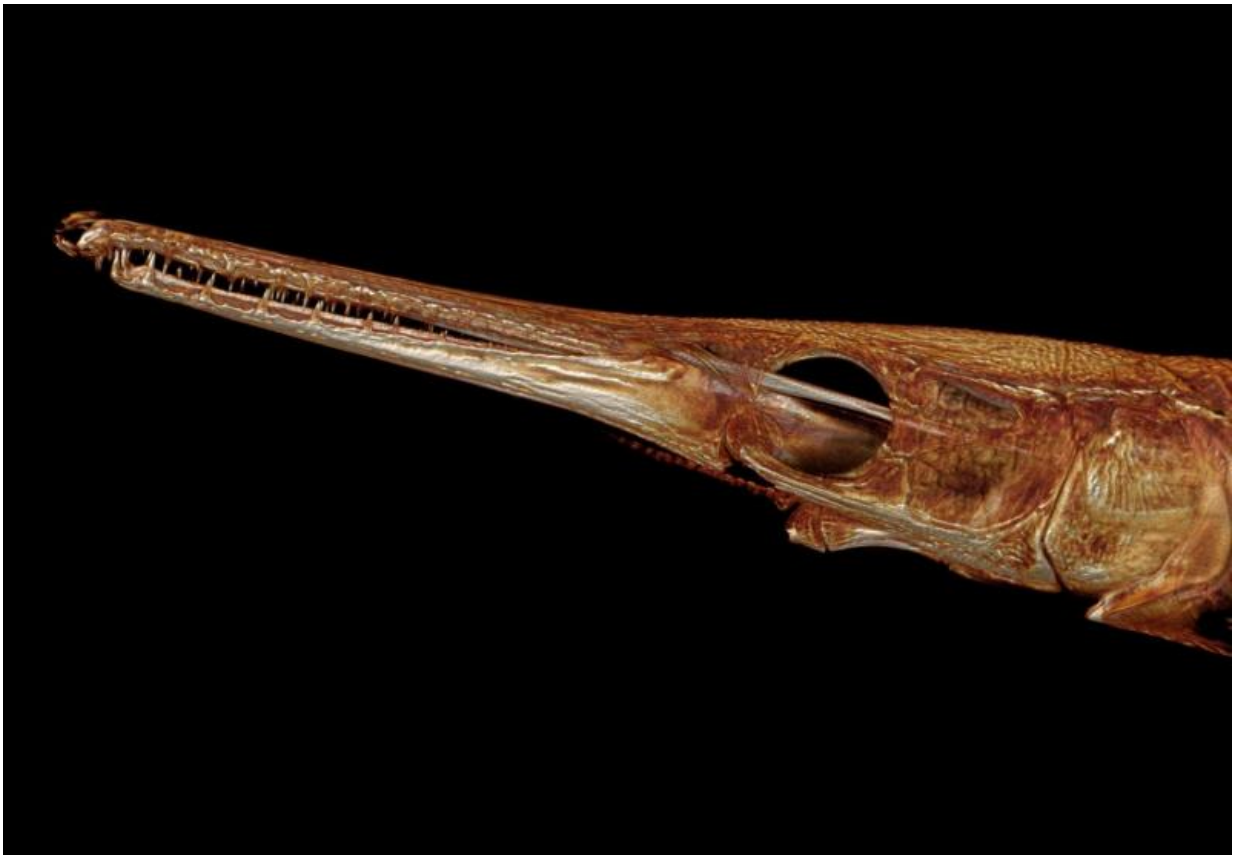
Lepisosteus oculatus (Spotted gar).

His next project is to scan all 50,000 vertebrate species on Earth—an undertaking he thinks is possible within a few years using half a dozen CT scanners like the one at Friday Harbor Laboratories. Colleagues at museums around the U.S. are writing a grant proposal to accomplish this feat.