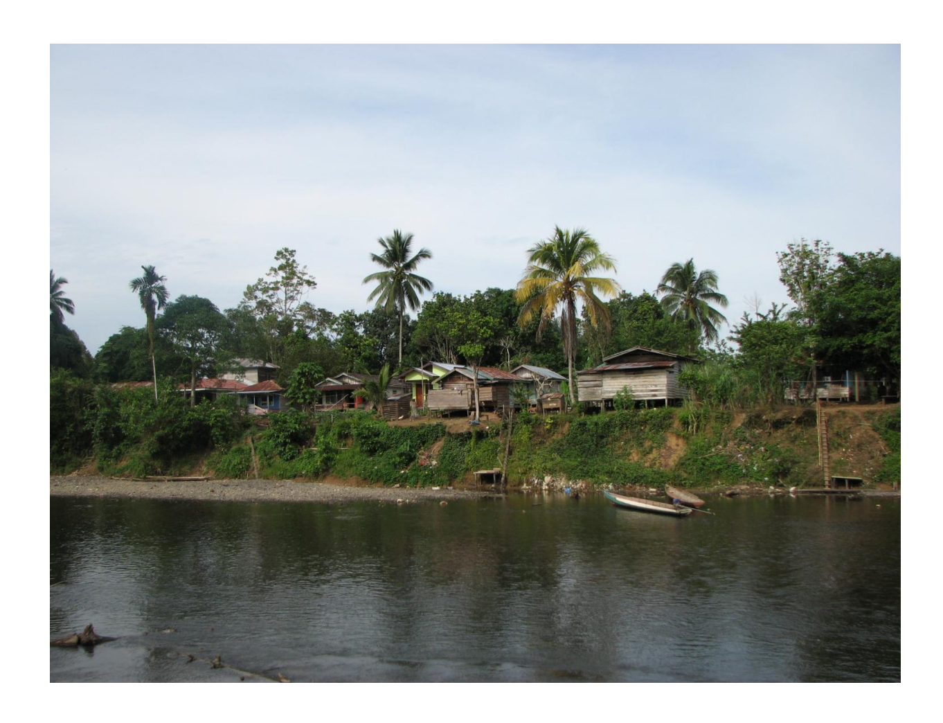
Dayak village with houses on pilotis, Southeast Borneo.

Lastly, the authors propose that a language shift occurred in Southeast Borneo after the migration of Banjar to Madagascar. It is thought that the Banjar, currently speaking a Malay language, presumably spoke a language closer to that reconstructed for Proto-Malagasy. This linguistic change would have followed a major cultural and genetic admixture with Malay, driven by a Malay Empire trading post in Southeast Borneo. The collapse of the Malay Empire during the 15th and 16th centuries could correspond to the end of the Malay gene mix into the Banjar population.