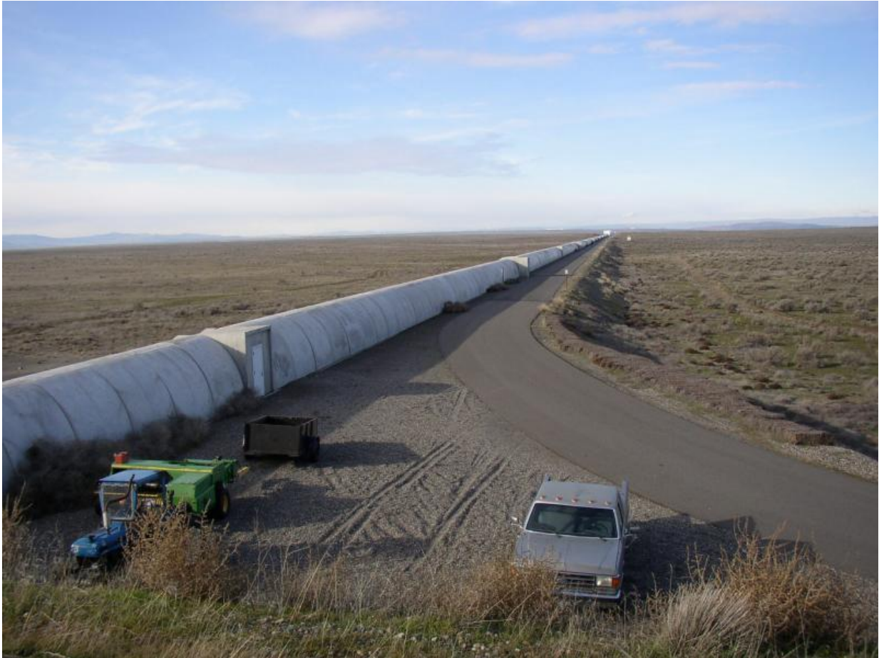
Northern leg of LIGO interferometer in Washington, US.

Observing gravitational waves either from single neutron stars or binary pairs would reveal the physics of matter under the most extreme conditions in the universe. Having three detectors working in conjunction will also mean that we can be more accurate about the position in the sky from which a wave is coming. That will help us to identify any signals from these sources seen by conventional telescopes –