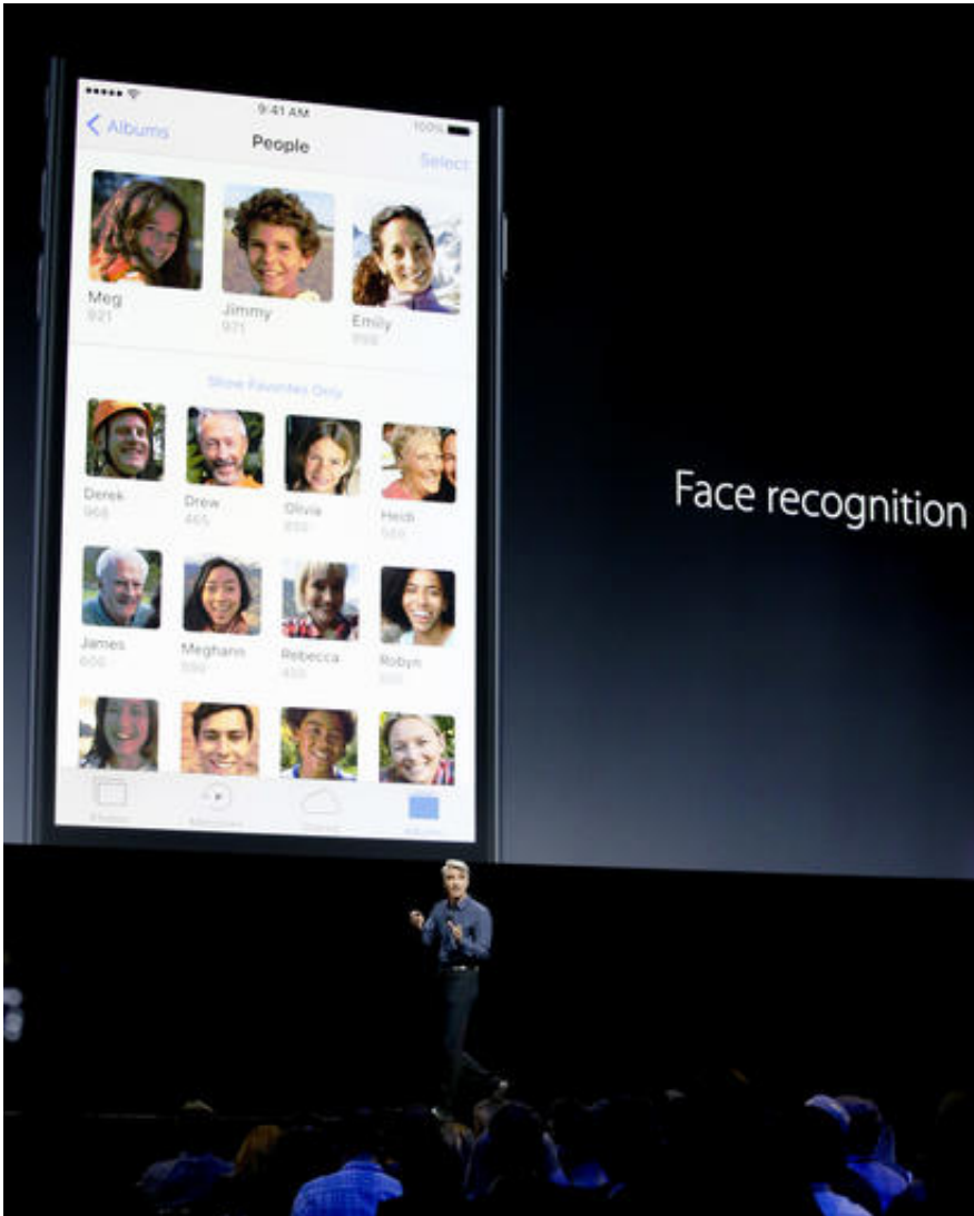
Craig Federighi, Apple senior vice president of software engineering, speaks about Photos in iOS10 at the Apple Worldwide Developers Conference in the Bill Graham Civic Auditorium in San Francisco, Monday, June 13, 2016.