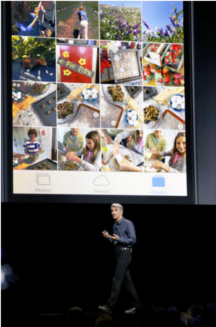
Craig Federighi, Apple senior vice president of software engineering, speaks about Photos in iOS10 at the Apple Worldwide Developers Conference in the Bill Graham Civic Auditorium in San Francisco, Monday, June 13, 2016.