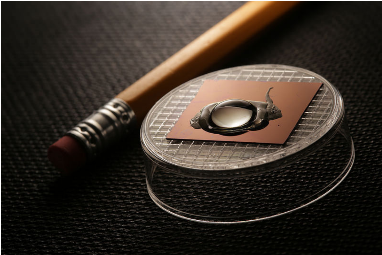
Single gene mutation biosensor.