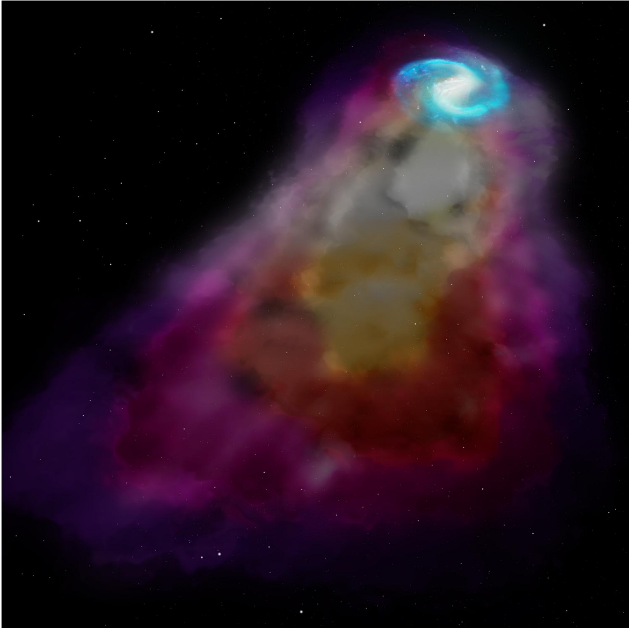
Artist's impression of the gas cloud and galaxy.

As an archaeologist digs down they find older and older objects. The same is true for astronomers—as they build bigger telescopes and develop new techniques to see farther into the Universe, they look further and further back in time.