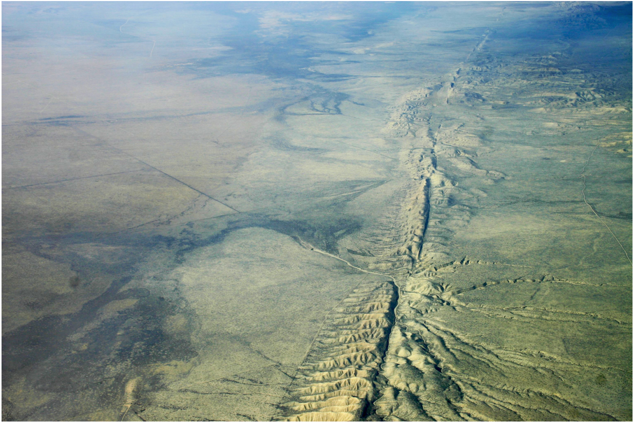
Aerial view of the San Andreas Fault in the Carrizo Plain, 8,500 ft. altitude.