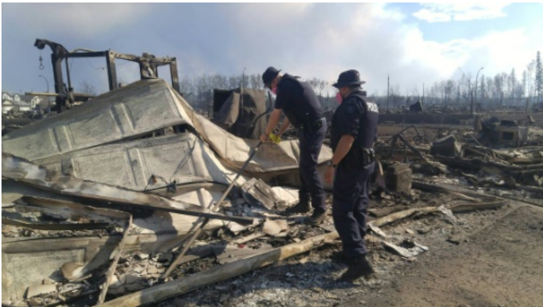
Alberta Royal Canadian Mounted Police inspect burnt out homes destroyed by the Fort McMurray Wildfire, on May 7, 2016

"There's a great deal of hazardous material to be cleaned up, and many other things to be done before the city is safe for families to go home," she said.