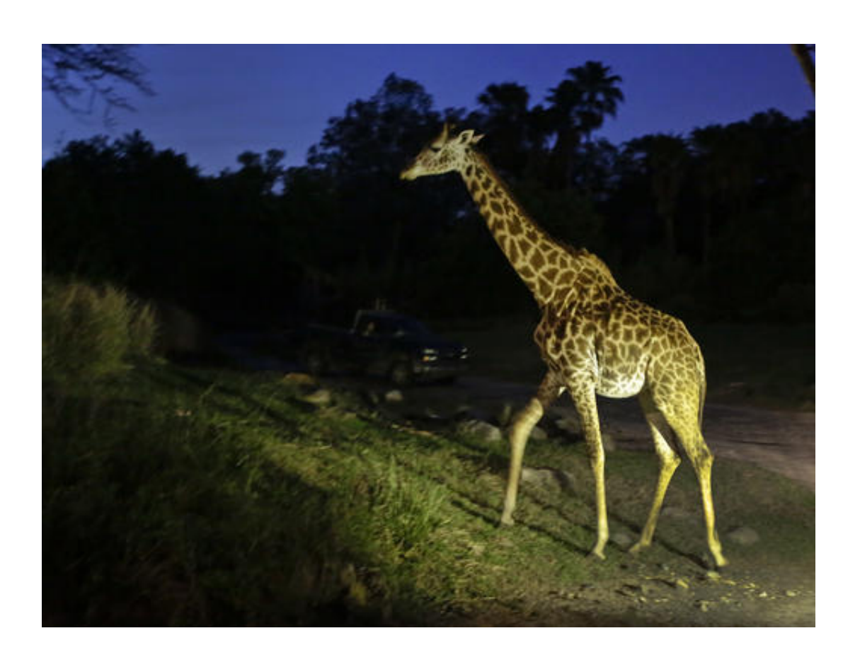
In this Tuesday, April 19, 2016 photo, a giraffe roams on the Savannah during a

At Six Flags Discovery Kingdom in Vallejo, The Joker, a hybrid steel and wooden coaster, will leave riders a little twisted—but in a good way—when it debuts May 29. The park has added steel tracks to the wooden frame of the Roar coaster, built in 1999, to create the hybrid experience. The 3,200-foot-long Joker will also include inversions, which the park says is a first for a wooden roller coaster, and will feature 15 moments of what the park is calling "extreme" airtime.