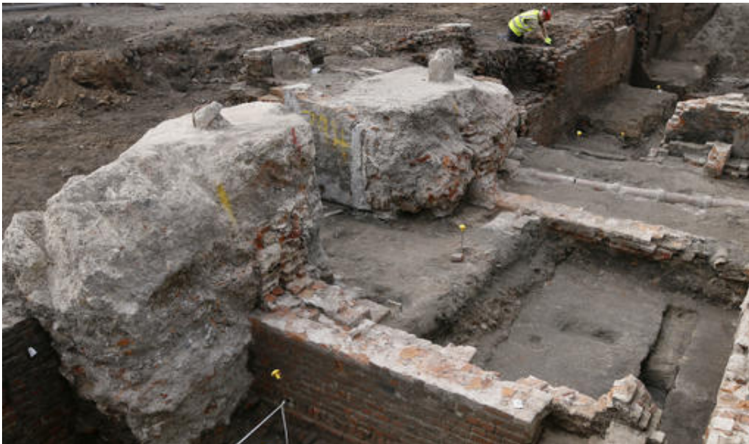
An archaeologist works on the exposed remains as the site of Shakespeare's Curtain Theatre is excavated in Shoreditch in London, Tuesday, May 17, 2016.

The dig has uncovered the outline of a rectangular venue about 100 feet (30 meters) by 72 feet (22 meters) that could hold about 1,000 people. Workers have uncovered sections of the theater's gravel yard, where "groundlings" who had bought cheap tickets stood, and segments of wall up to 5 feet (1.5 meters) high.