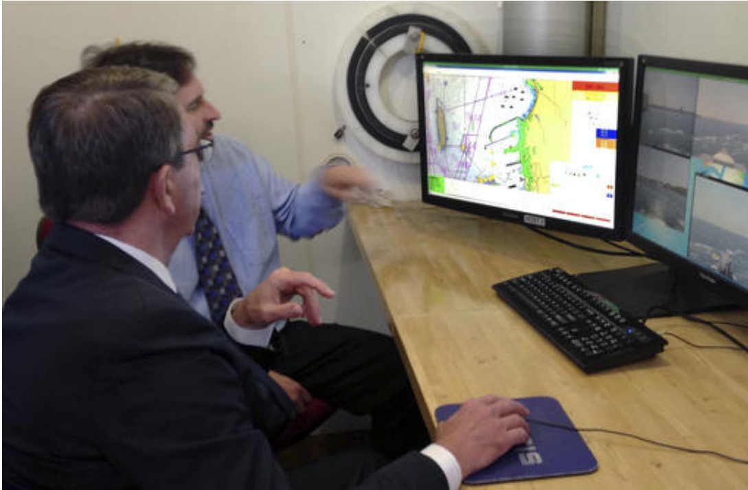
U.S. Defense Secretary Ashton Carter, foreground, uses a computer to set the course for an unmanned surface vehicle in adjacent the bay at Naval Undersea Warfare Center Wednesday, May 25, 2016, in Newport, R.I. Carter told students at the nearby U.S. Naval War College in Newport that the government needs to develop technology faster and reconnect with the tech industry.