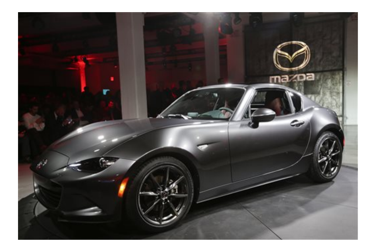
Patrons watch as Mazda unveils the Mazda MX-5 RF Tuesday, March 22, 2016, in New York.