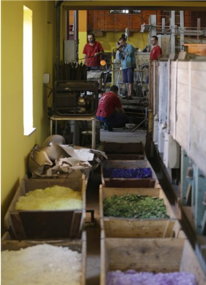
In this picture taken on Thursday, Feb. 18, 2016, a worker blows a piece of glass for installation designed for Lasvit glass maker at a factory in Lindava, Czech Republic.