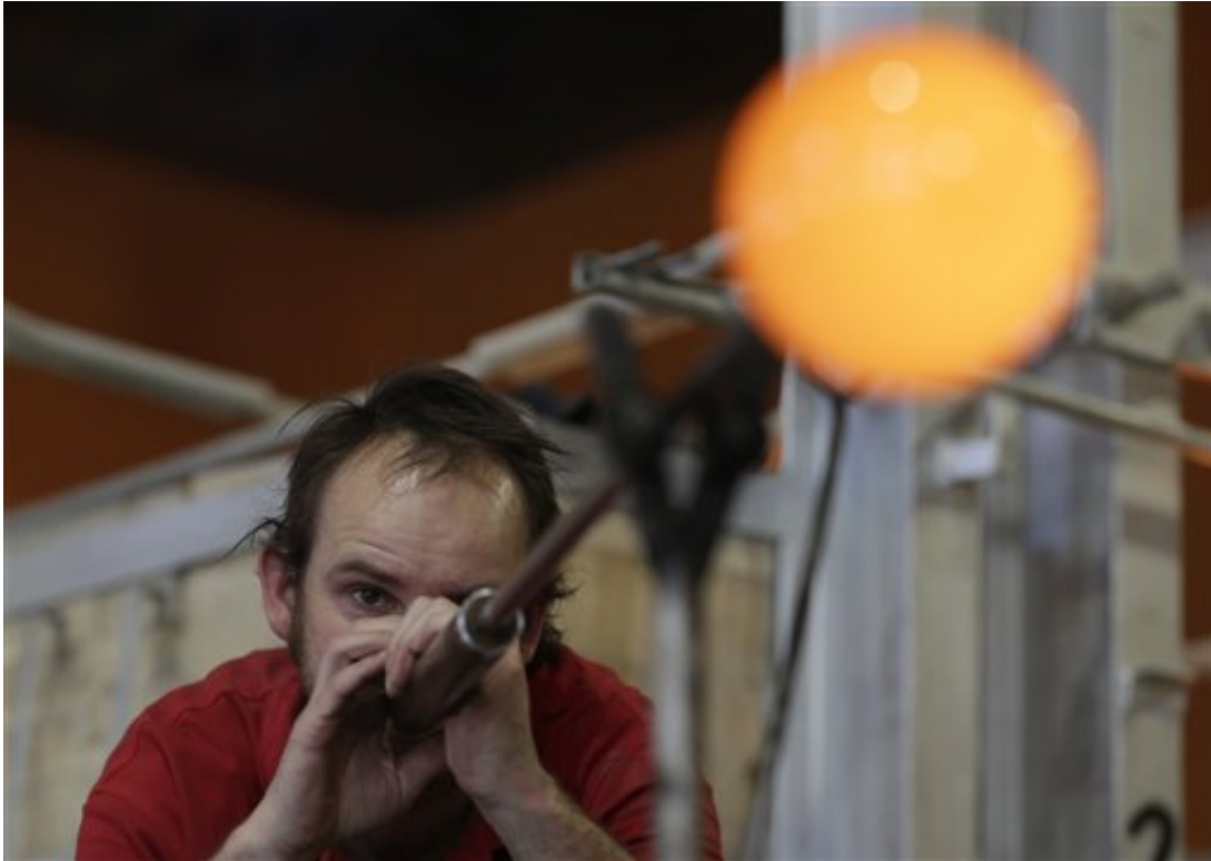
In this picture taken on Thursday, Feb. 18, 2016, a worker blows a piece of glass for installation designed for Lasvit glass maker at a factory in Lindava, Czech Republic.