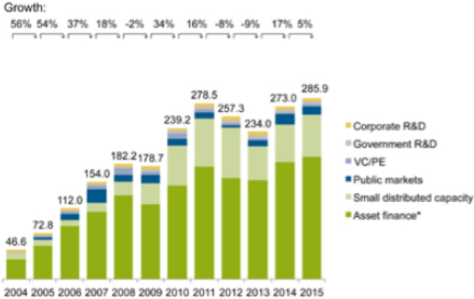
FIGURE 1. GLOBAL NEW INVESTMENT IN RENEWABLE ENERGY BY ASSET CLASS, 2004-2015, $BN

*Asset finance volume adjusts for re-invested equity. Total values include estimates for undisclosed deals