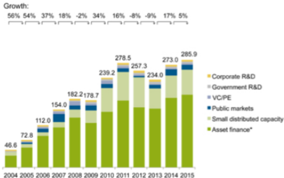
FIGURE 1. GLOBAL NEW INVESTMENT IN RENEWABLE ENERGY BY ASSET CLASS, 2004-2015, $BN

*Asset finance volume adjusts for re-invested equity. Total values include estimates for undisclosed deals