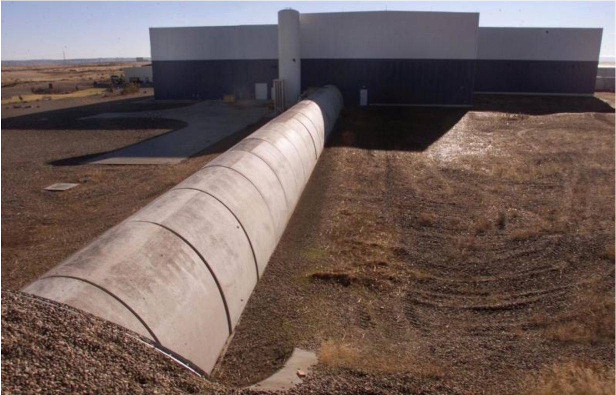
LIGO Washington.

When a gravitational wave passes by, the stretching and squashing of space causes these arms alternately to lengthen and shrink, one getting longer while the other gets shorter and then vice versa. As the arms change lengths, the laser beams take a different time to travel through them. This means that the two beams are no longer "in step" and what we call an interference pattern is produced – hence the name interferometer.