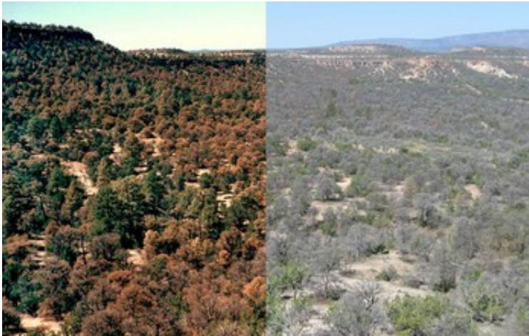
Evergreen pinyon pines turn brown from drought (left). A year later, pine needles are gone (right).