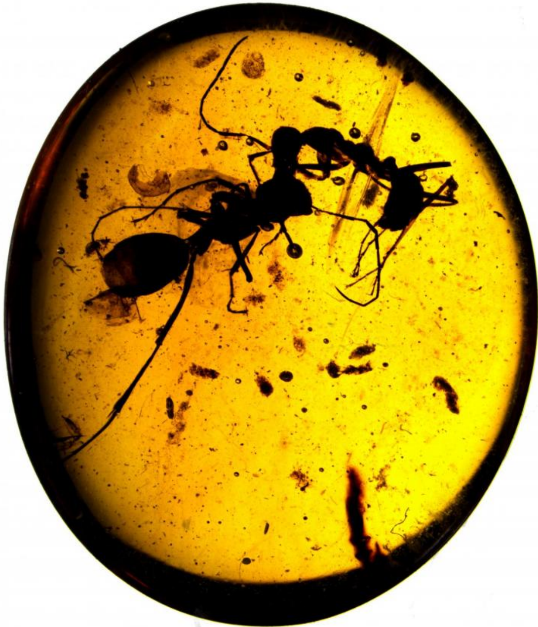
Two different ant species fighting, caught in 100-million-year old Burmese amber.