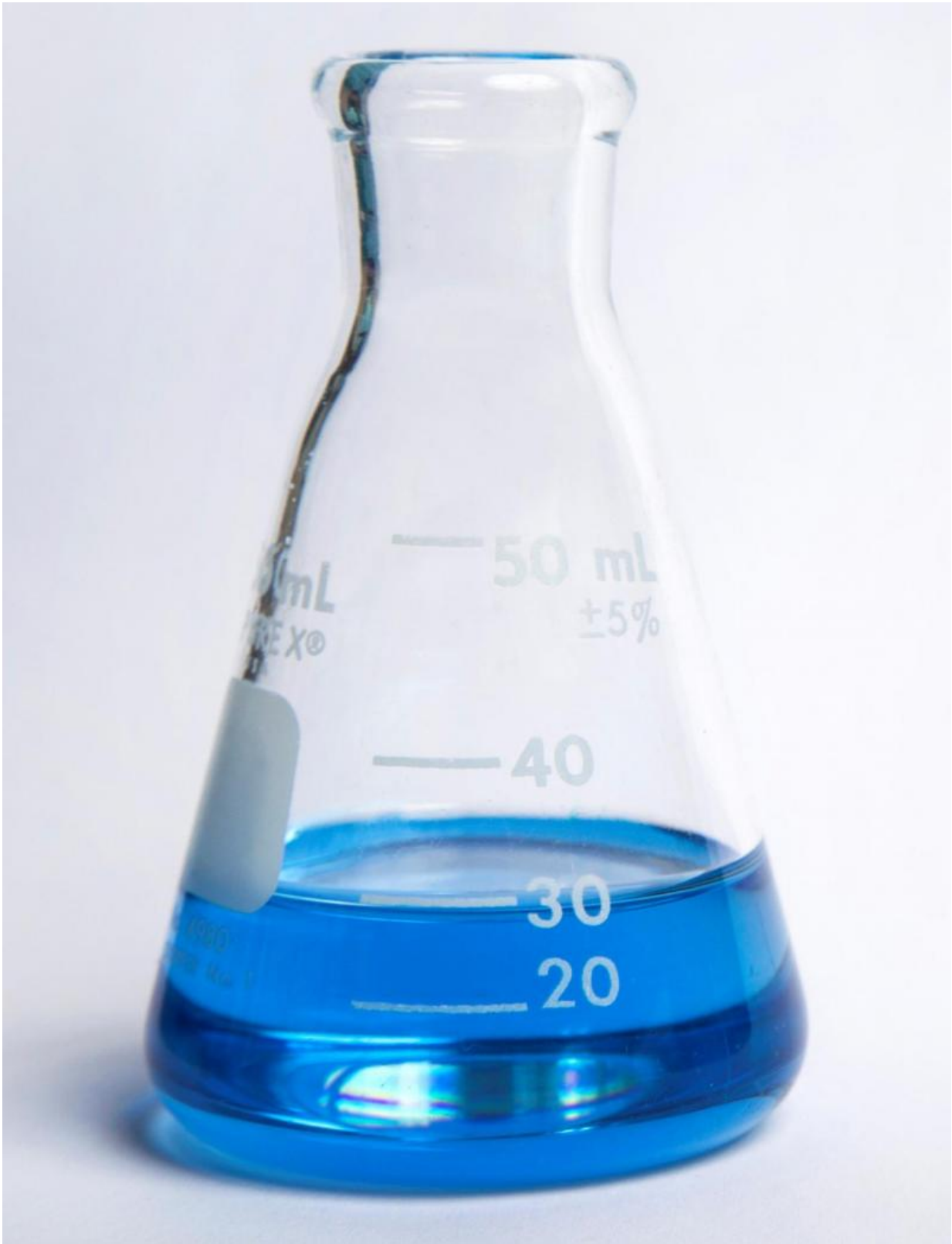
A flask containing indigoidine produced from E. coli .