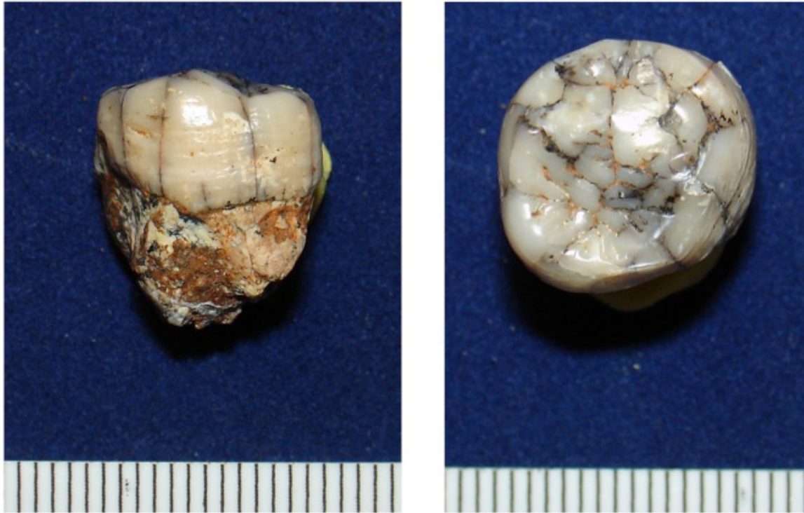
Examined tooth of Gigantopithecus from Thailand.

More information: Hervé Bocherens et al. Flexibility of diet and habitat in Pleistocene South Asian mammals: Implications for the fate of the giant fossil ape Gigantopithecus , Quaternary International (2015). DOI: 10.1016/j.quaint.2015.11.059