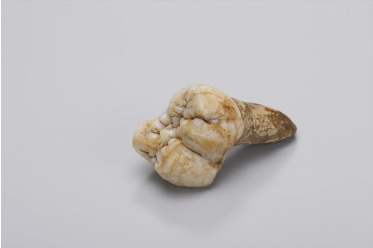
Large molar of Gigantopithecus from the collection Gustav Heinrich Ralph von Koenigswald in the Senckenberg Research Institute.