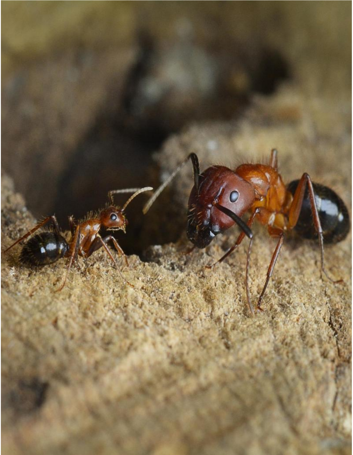
Florida carpenter ants, minor caste (left) and major caste, are shown. Credit: The