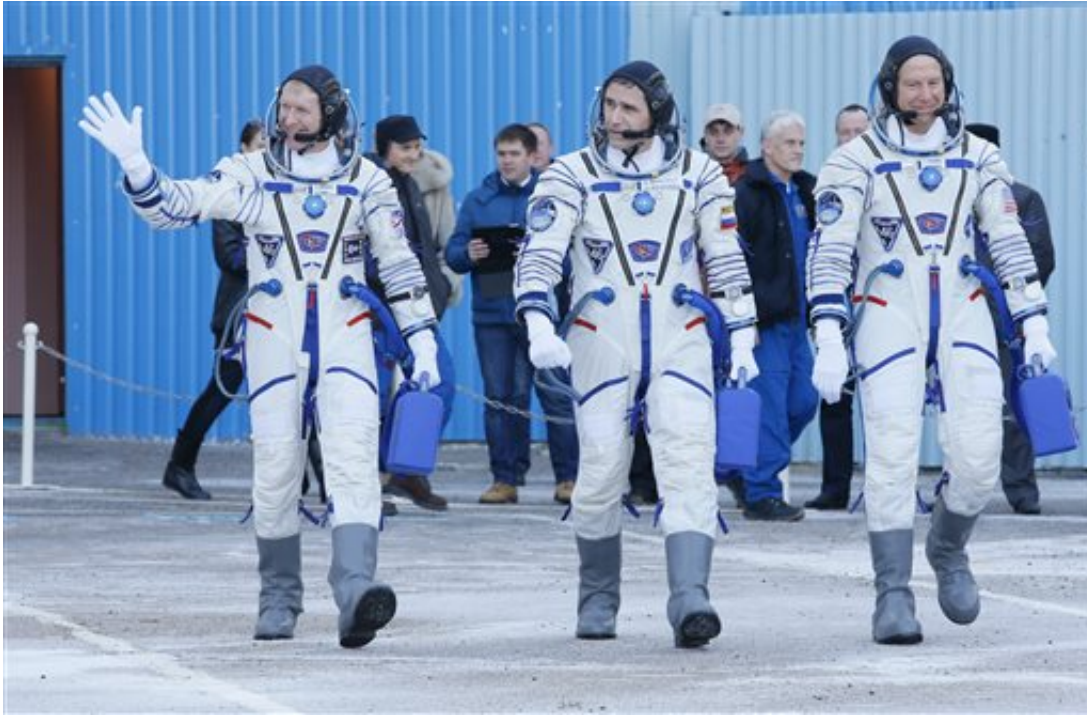
British astronaut Tim Peake, left, Russian cosmonaut Yuri Malenchenko, center, and U.S. astronaut Tim Kopra, members of the main crew of the expedition to the International Space Station (ISS), walk to report to members of the State Committee prior to the launch of Soyuz TMA-19M space ship at the Russian leased Baikonur cosmodrome, Kazakhstan, Tuesday, Dec. 15, 2015.