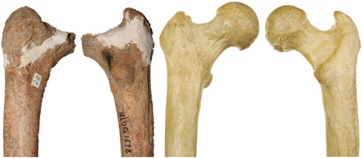
Red Deer Cave people thigh bone compared with a modern human (not to scale). Credit: Darren Curnoe, Ji Xueping & Getty Images, Author provided

We need to also keep in mind that most of what we know about human evolution is based on the fossil records of Europe and some parts of Africa, like the East African Rift Valley, and caves in South Africa.