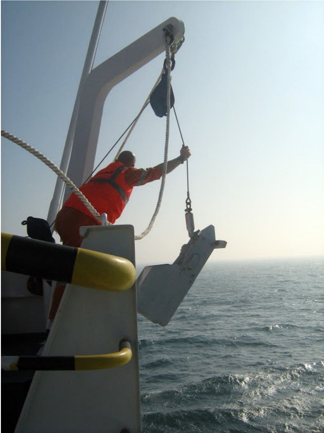
A ferry crewman works with gear used in the Continuous Plankton Recorder survey, an ongoing study of plankton in the North Atlantic and North Sea launched by a British marine biologist in the early 1930s.