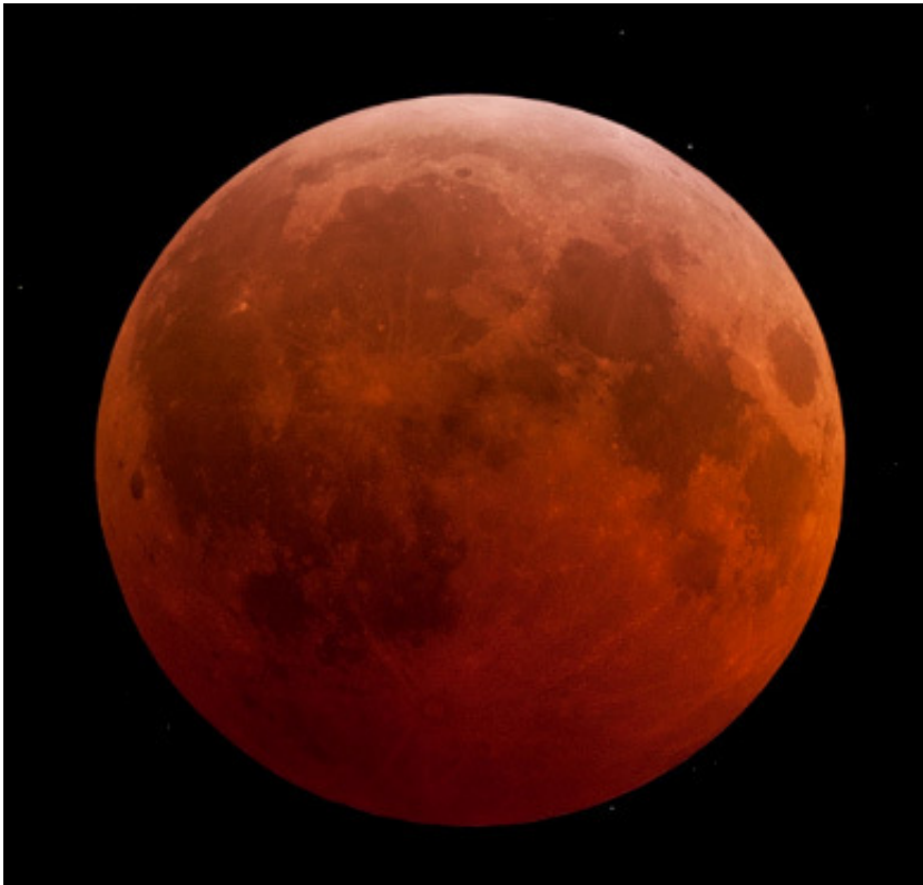
Lunar Eclipse from New Jersey 12-21-2010.

Don't forget about the total solar eclipse that's going to be happening in August, 2017. It's going to cross the United States from Oregon to Tennessee and should be perfect viewing for millions of people in North America. We've already got our road trip planned out.