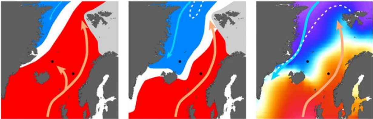
Evolution of Nordic sea surface circulation.

Today, the Nordic Seas surface waters are characterised by an east-west temperature gradient. The southernmost part of Greenland is at the same latitude as Bergen and Oslo in Norway, but the climate in Greenland is much cooler. The warm water near Scandinavia is brought northwards via the Norwegian Atlantic Current, a continuation of the North Atlantic Current, and is today responsible for the mild winter climate along the coast of Norway. Along east Greenland a cold water current known as the East Greenland Current flows southward and transports the major part of all exported Arctic sea ice.