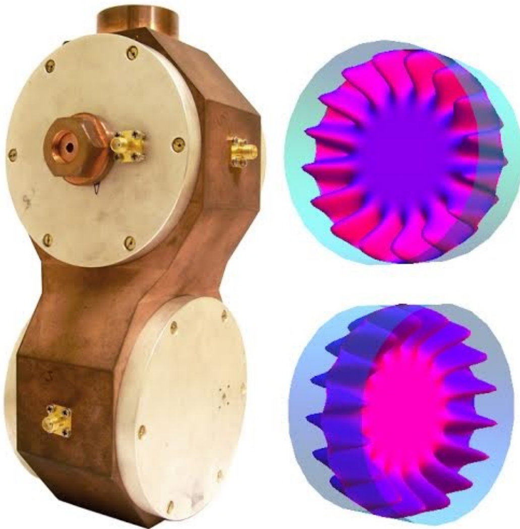
(Left) Photo of the orthogonal sapphire crystal mount, with (right) simulations of