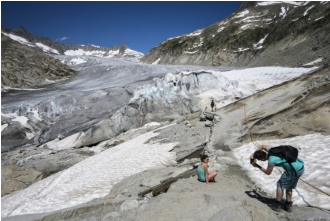
Tourists pose on the Rhone Glacier near Gletsch

The Alps function as a water tower that stores water, releasing it when it is most needed—in the hot and dry summer months.