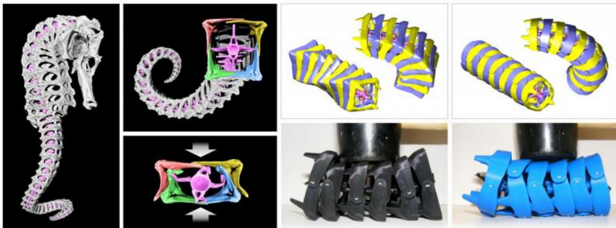
Left: Seahorse skeletons are composed of highly-articulated bony plates that surround a central vertebral column. Right: Bending and twisting performance of the prototypes.