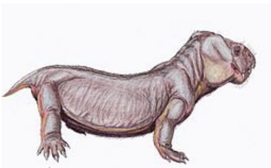
Restoration of Pristerodon mackayi . © Dmitry Bogdanov via Wikimedia Commons

Interestingly, it was discovered almost 200 years ago that the mammalian ear ossicles are the homologues of the the articular and quadrate, the bones that form the jaw articulation in reptiles and in the forerunners of mammals. In early mammalian evolution, a new jaw articulation evolved and these bones were separated from the skull and the mandible and only served for hearing. Therefore, it was uncertain if therapsids were already able to hear airborne sound. If so, their massive jaw articulation must have had a dual function – to withstand the forces from feeding and to conduct weak sound impulses to the inner ear.