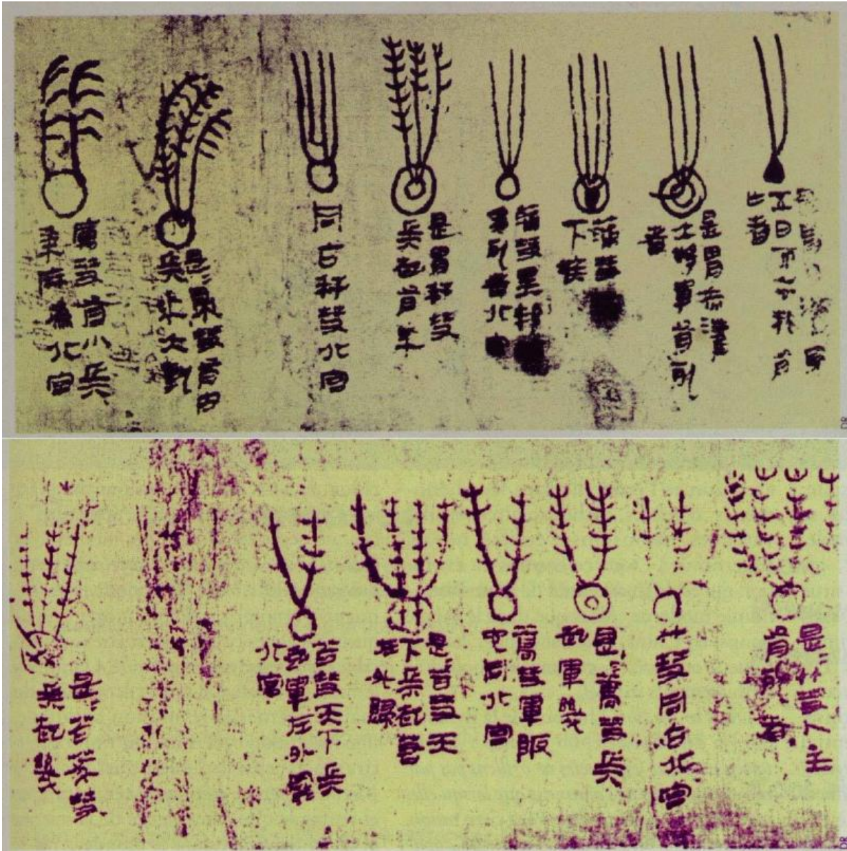
The Mawangdui silk, showing the shapes of comet tails and the different