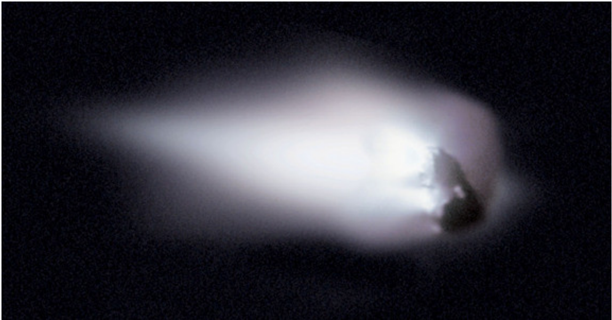
The nucleus of Halley's Comet, obtained by the Halley Multicolour Camera (HMC) on board the Giotto spacecraft during its flyby on March 13, 1986.

The last time Halley's Comet was seen was in 1986, which means it will not reappear until 2061. As always, some are choosing to prepare for the worst – believing its next pass will signal the end of life as we know it – while others are contemplating if they will live long enough to witness it.