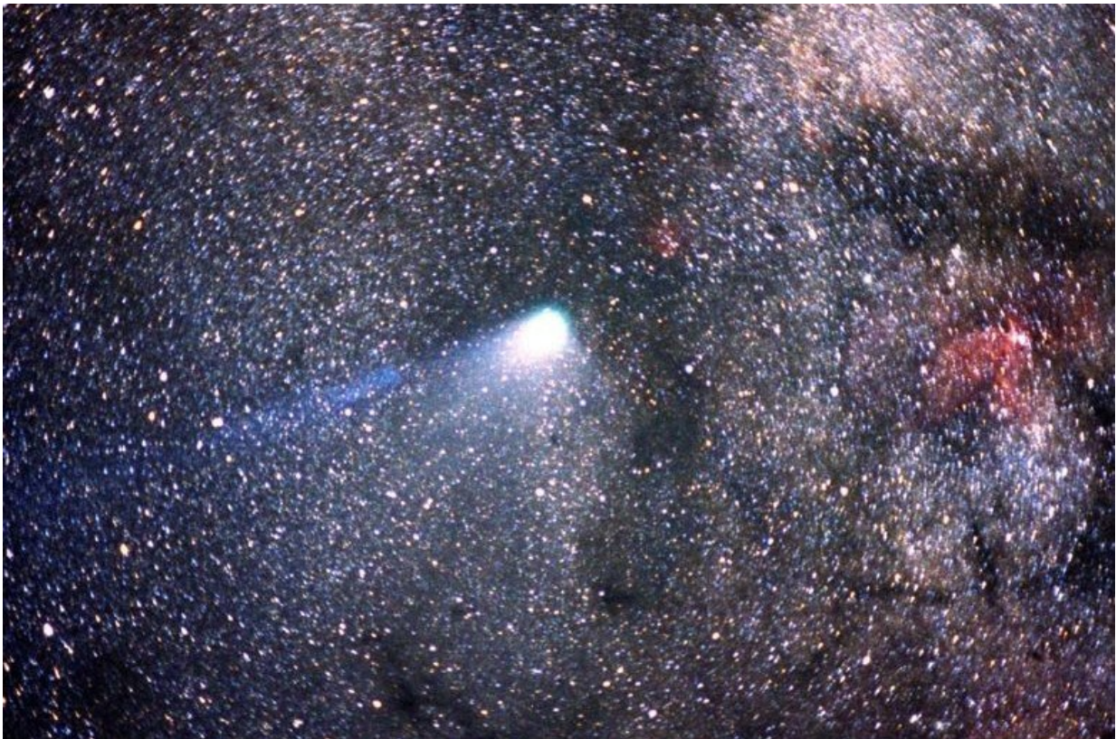
Photo of Halley's Comet crossing the Milky Way, taken by the Kuiper Airborne Observatory in New Zealand on April 8th/9th, 1986.