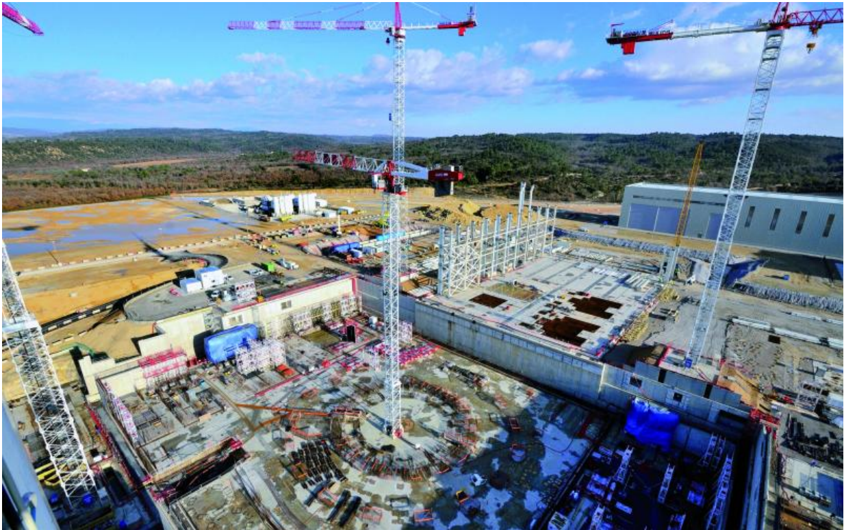
ITER, April 2015