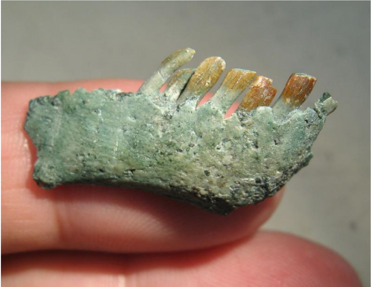
Chilesaurus diegosuarezi - Right jaw and teeth in side view.

Environmental Sciences, University of Birmingham said: