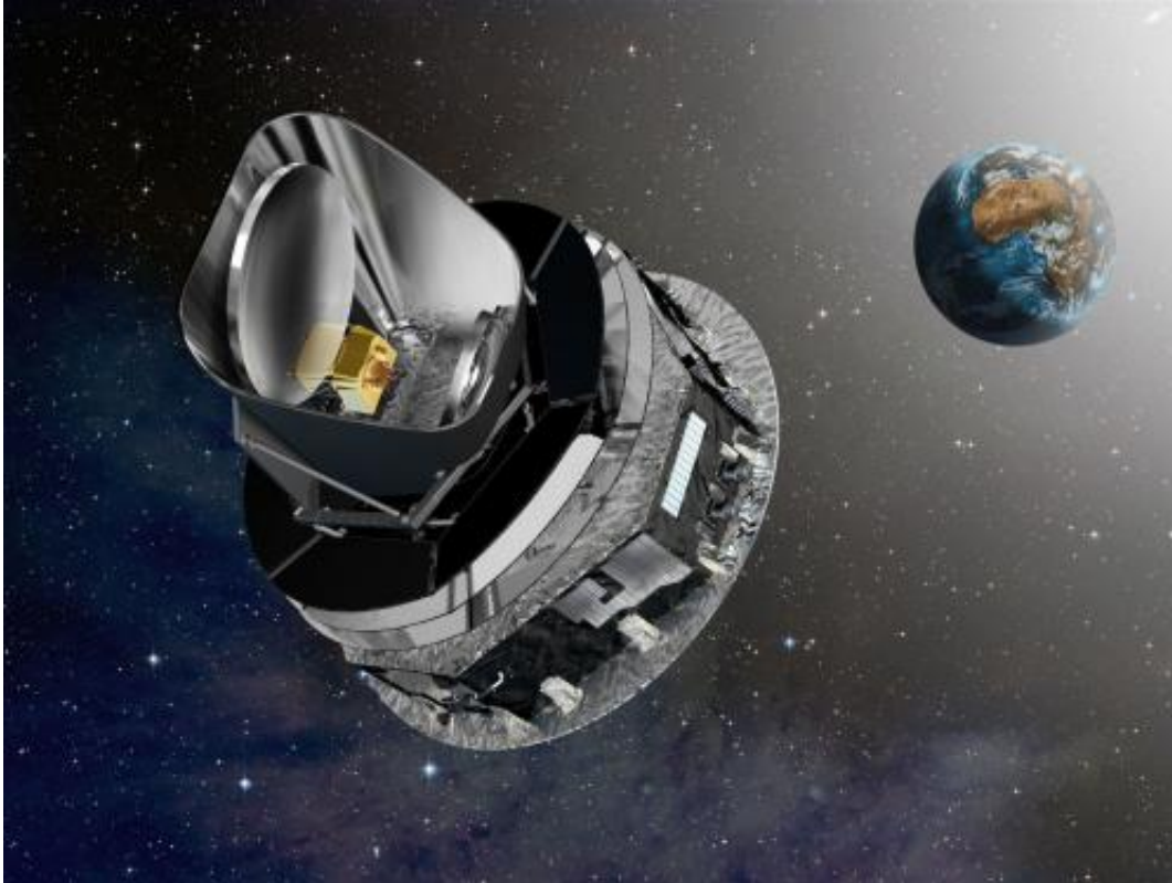
Illustration of the ESA Planck Telescope in Earth orbit.

Two possibilities exist: either the Universe is finite and has a size, or it's infinite and goes on forever. Both possibilities have mind-bending implications.