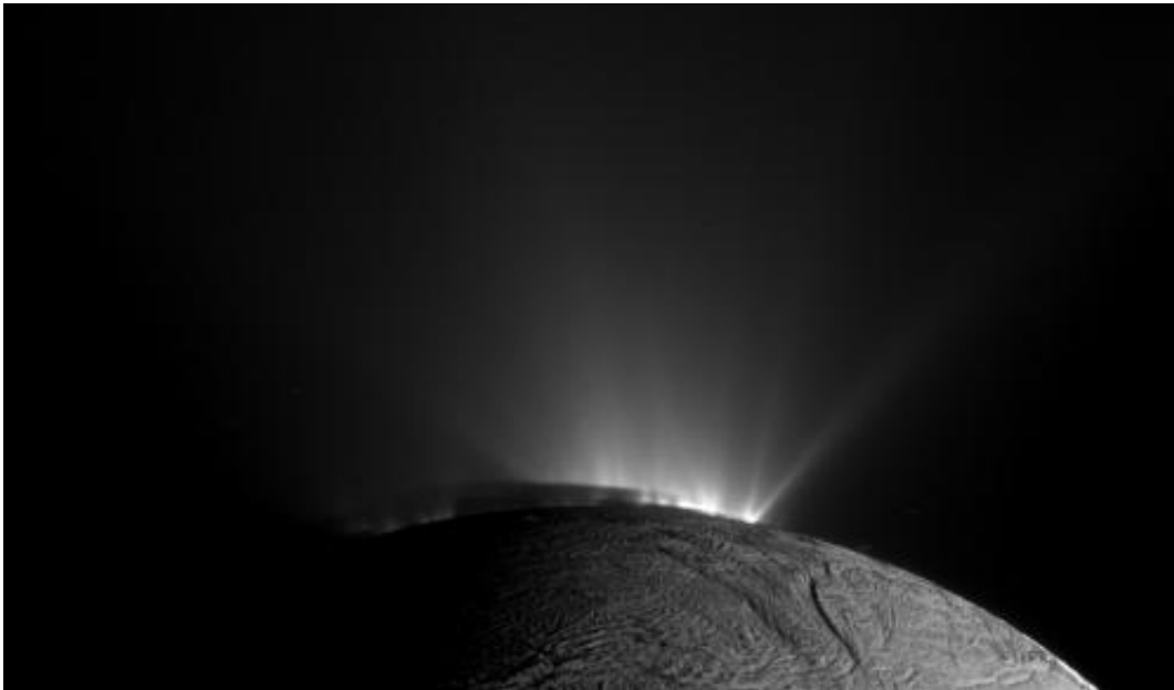
The view from Cassini towards the geyser region of Enceladus.

There may also be water on the dwarf planets Ceres and Pluto, Neptune's moon Triton, and several other objects in the solar system – but only further investigation will tell. Two other objects have lakes and oceans, but not of water. Titan has lakes of methane and ethane, for example – the only extraterrestrial object we know of with liquid on the surface – and volcanic Io has a subsurface ocean of liquid magma .