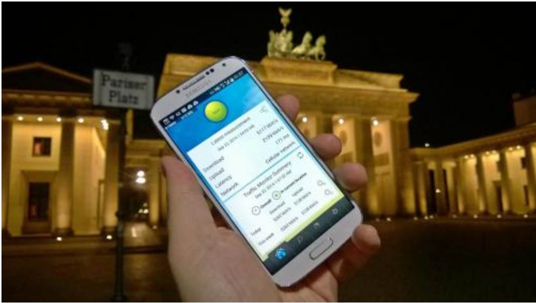
A user with Netradar in Berlin, Germany.