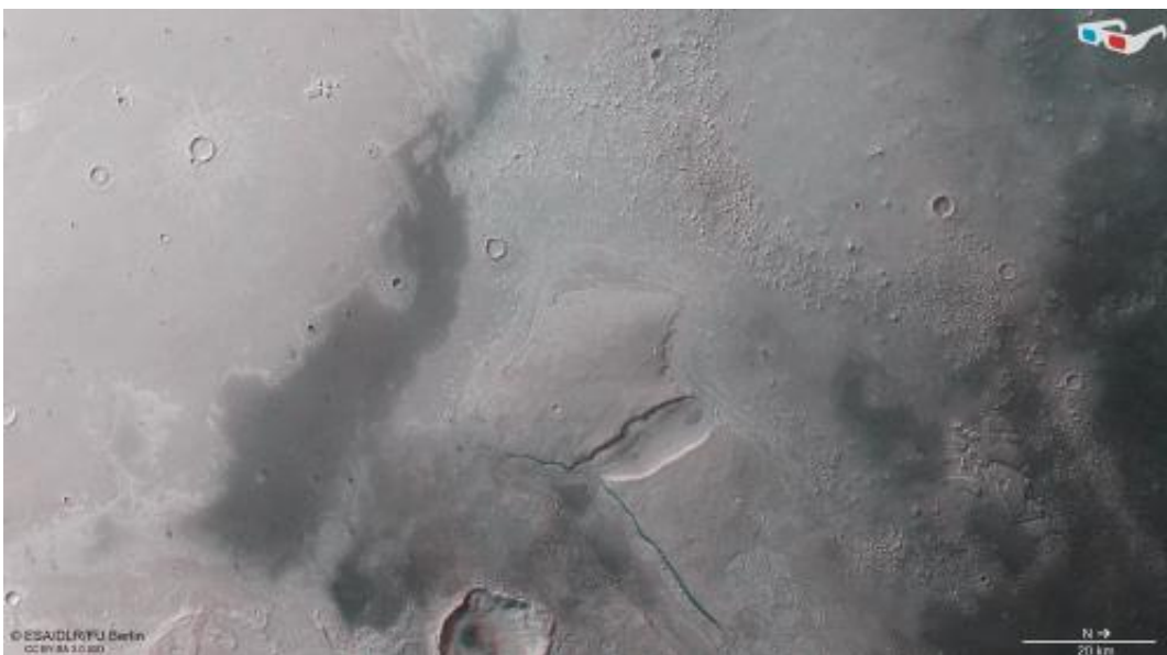
This anaglyph image showing part of the Cydonia Mensae region of Mars, provides a 3D view of the landscape when viewed using stereoscopic glasses with red–green or red–blue filters. It was derived from data acquired by the nadir channel and one stereo channel of the High Resolution Stereo Camera on ESA’s